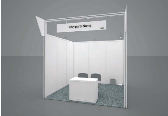
Design-1 - EUR 35/m 2