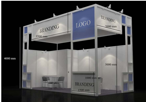
Design-3 - EUR 80/m 2