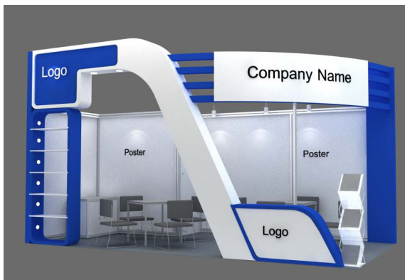
Design-4 - EUR 139/m 2